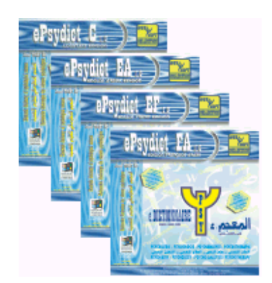
www.arabpsynet.com/HomePage/Psy-Dict.htm Electronic Dictionary of Psychological Sciences

ARADDSYNET JOURNAL : Nº 2-ADRIL - MAY - JUNE 2004